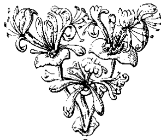
Wood engravings by Thomas Bewick